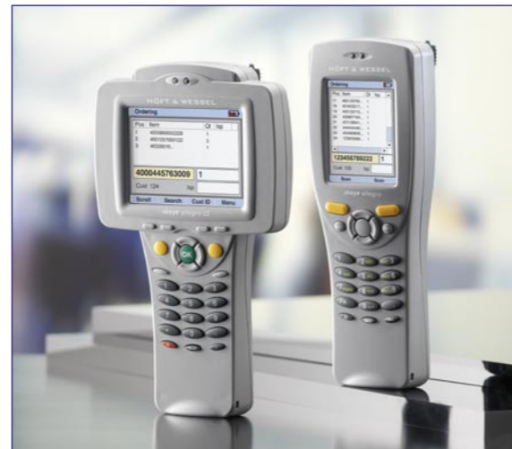
skeye.allegro and skeye.allegro LS