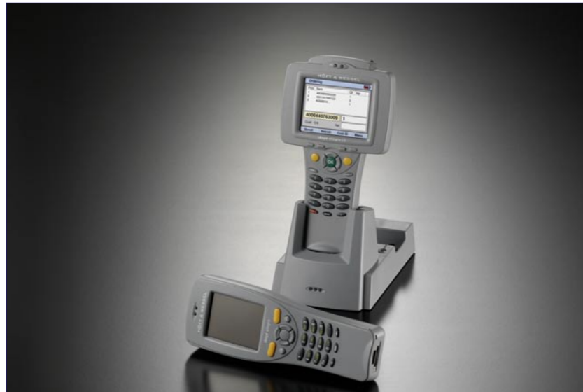
skeye.allegro LS skeye.allegro

RFID capable products of the Skeye series